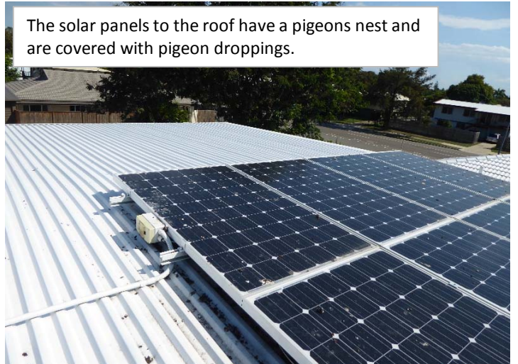
The solar panels to the roof have a pigeons nest and are covered with pigeon droppings.