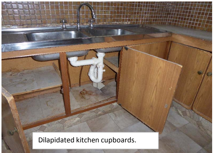
Dilapidated kitchen cupboards.