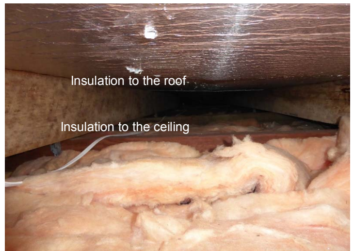
Insulation to the roof