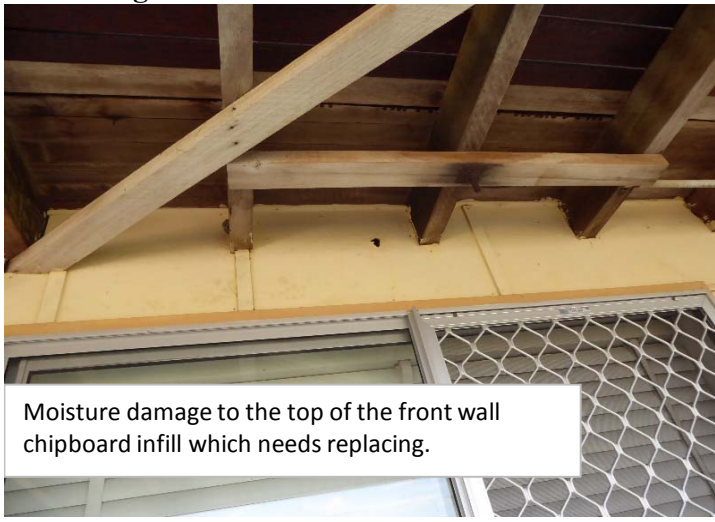
Moisture damage to the top of the front wall chipboard infill which needs replacing.