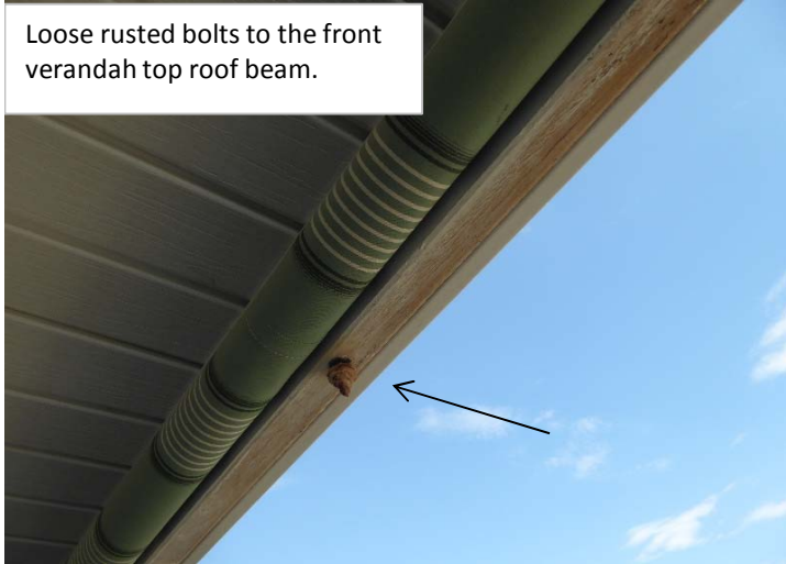
Loose rusted bolts to the front verandah top roof beam.