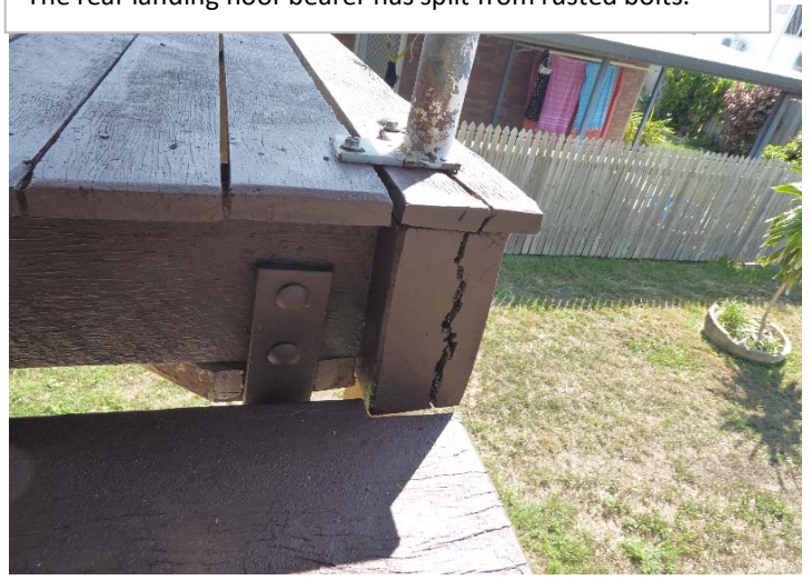
The rear landing floor bearer has split from rusted bolts.