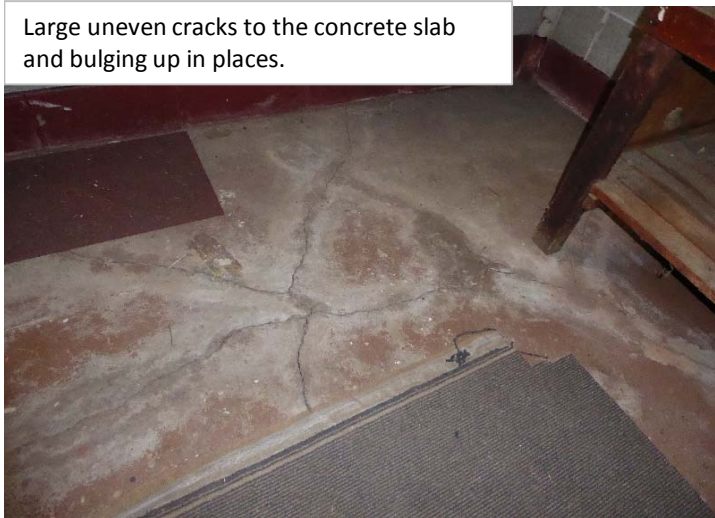
Large uneven cracks to the concrete slab and bulging up in places.